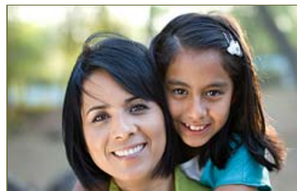
The success of a community involves everyone

Affordable homes contribute to California's efforts to protect the environment.