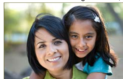
The success of a community involves everyone

A supply of homes that are affordable to all benefits individual health as well.